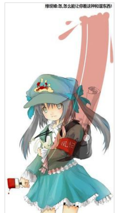
Satirical internet cartoon showing 'Green Dam Girl' wearing a river crab hat, and armed with a paintbrush

On 11 June 2009, a team released a third-party tool aiming to provide users with options to disable the software, change the master password and perform post-uninstallation clean-up (i.e., removing files and registry entries left behind by the uninstaller). [33]