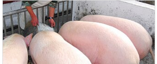
Green Dam Youth Escort recognizes pornographic images by analyzing skin-coloured regions, causing the barring of this image of pink-coloured pigs.

Jinhui claimed that Green Dam recognized pornographic images by analyzing skin-coloured regions, complemented by human face recognition . However, according to a Southern Weekly article, the software is incapable of recognizing pictures of nudity featuring black- or red-skinned characters but sensitive enough to images with large patches of yellow that it censors promotional images of the film Garfield: A Tail of Two Kitties . The article also cited an expert saying that the software's misrecognition of "inappropriate contents" in applications including Microsoft Word can lead it to forcefully close those applications without notifying the user, thus cause data losses. [44] On 21 June 2009, Ming Pao reported that the software detected and censored pictures of Chinese political leaders as pornography. [45]