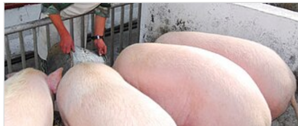
Green Dam Youth Escort recognizes pornographic images by analyzing skin-coloured regions, causing the barring of this image of pink-coloured pigs.

Jinhui claimed that Green Dam recognized pornographic images by analyzing skin-coloured regions, complemented by human face recognition . However, according to a Southern Weekly article, the software is incapable of recognizing pictures of nudity featuring black- or red-skinned characters but sensitive enough to images with large patches of yellow that it censors promotional images of the film Garfield: A Tail of Two Kitties . The article also cited an expert saying that the software's misrecognition of "inappropriate contents" in applications including Microsoft Word can lead it to forcefully close those applications without notifying the user, thus cause data losses. [44] On 21 June 2009, Ming Pao reported that the software detected and censored pictures of Chinese political leaders as pornography. [45]