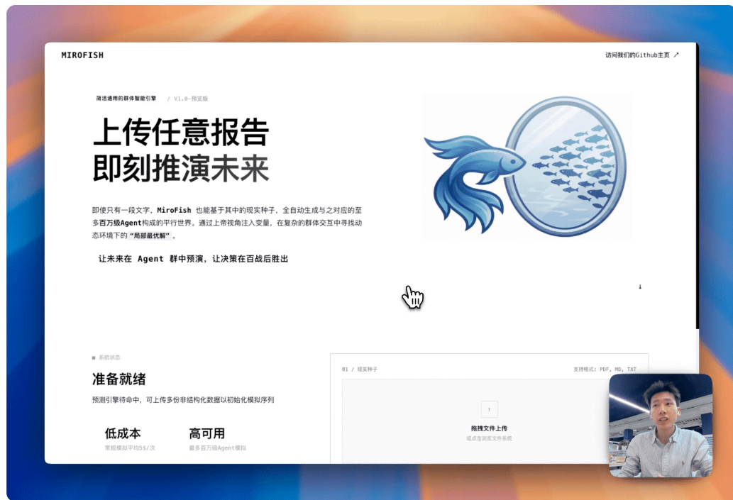
Click the image to watch the complete demo video for prediction using BettaFish-generated "Wuhan University Public Opinion Report"