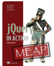
jQuery in Action

( https://www.packtpub.com/en-us/product/learning-jquery-fourth-edition-9781782163152 )