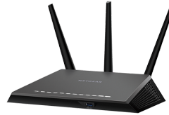
R7000P ( https://www.netgear.com/support/product/r7000p/ )