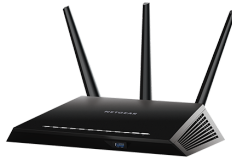
R6900P ( https://www.netgear.com/support/product/r6900p/ )