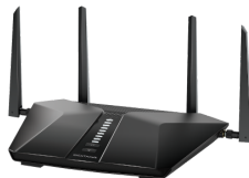
RAX45 ( https://www.netgear.com/support/product/rax45/ )