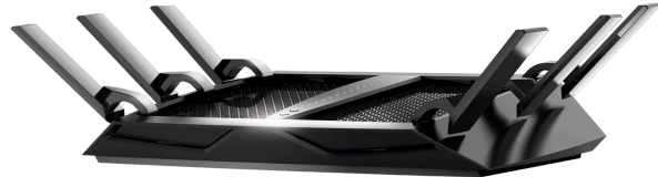
R7960P ( https://www.netgear.com/support/product/r7960p/ ) R8000P ( https://www.netgear.com/support/product/r8000p/ )