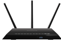
R7000 ( https://www.netgear.com/support/product/r7000/ ) R7000P ( https://www.netgear.com/support/product/r7000p/ )