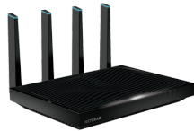
R8500 ( https://www.netgear.com/support/product/r8500/ ) RAX20 ( https://www.netgear.com/support/product/rax20/ )