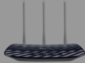
AC750 Wireless Dual Band Router Archer C20