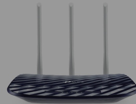
AC750 Wireless Dual Band Router Archer C20