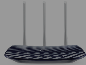
AC750 Wireless Dual Band Router Archer C20

> How to Find the Hardware Version on Your TP-Link Device