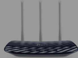
AC750 Wireless Dual Band Router Archer C20

> How to Find the Hardware Version on Your TP-Link Device