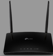
AC750 Wireless Dual Band 4G LTE Router Archer MR200