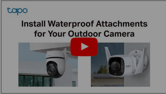
Install Waterproof Attachments for Your Outdoor Camera