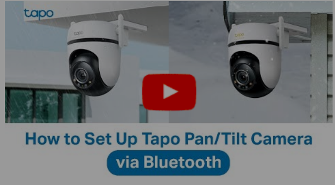
How to Set Up Your Outdoor Pan/Tilt Security Wi-Fi Camera via Bluetooth