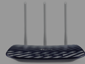
AC750 Wireless Dual Band Router Archer C20