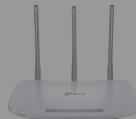
300Mbps Wireless N Router TL-WR845N